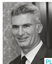
CARMELO ABELA Minister for Home Affairs and National Security