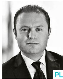
DR JOSEPH MUSCAT Prime Minister