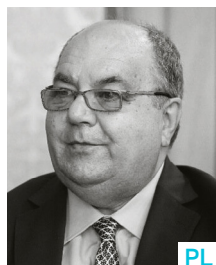
DR EMMANUEL MALLIA Minister for Competitive- ness and Digital, Maritime and Services Economy