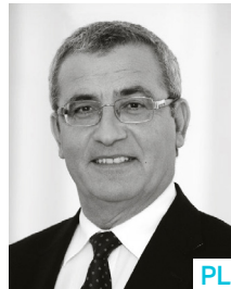
EVARIST BARTOLO Minister for Education and Employment