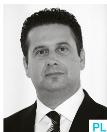
DR EDWARD ZAMMIT LEWIS Minister for Tourism