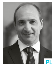
CHRISTOPHER FEARNE Minister for Health