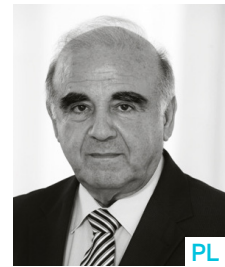
DR GEORGE VELLA Minister for Foreign Affairs