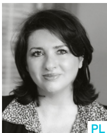
DR HELENA DALLI Minister for Social Dialogue, Consumer Affairs and Civil Liberties