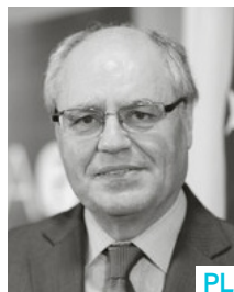
PROF. EDWARD SCICLUNA Minister for Finance