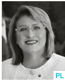
MARIE-LOUISE COLEIRO PRECA President

FOR MORE INFORMATION, CLICK ON THE PICTURES: