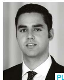
DR IAN BORG Parliamentary Secretary for the EU Presidency 2017 and EU Funds