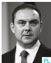
DR OWEN BONNICI Minister for Justice, Culture and Local Government